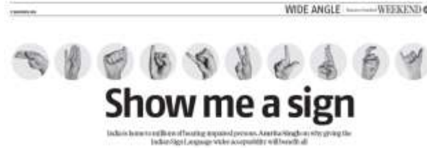
Business Standard, Nov. 17, 2018