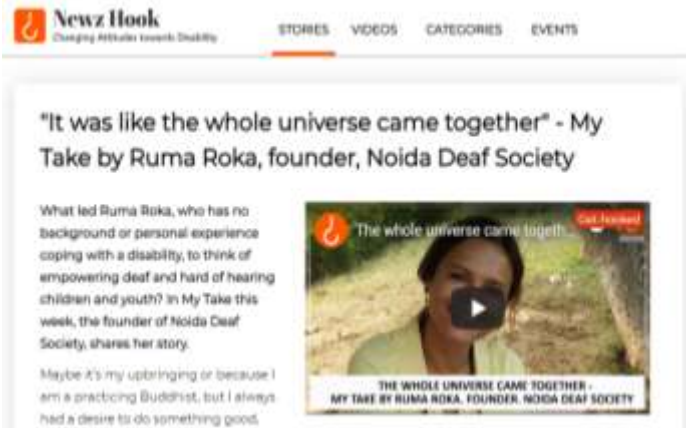
Story covered in News Hook