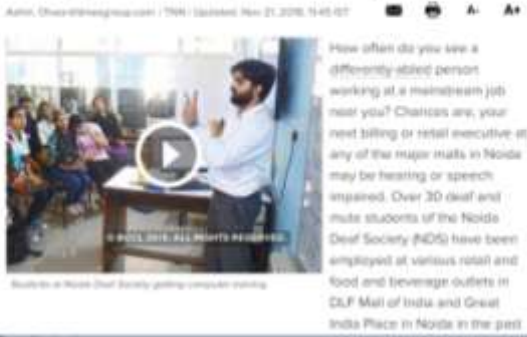
Article in Times of India Newspaper