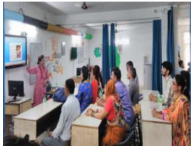
Workshop for Parents