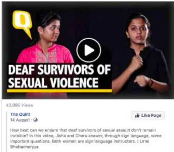
The Quint, Aug. 14, 2018