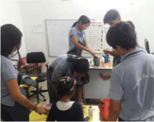
Students of Pathways School, Noida volunteered to paint portions of our primary wing.