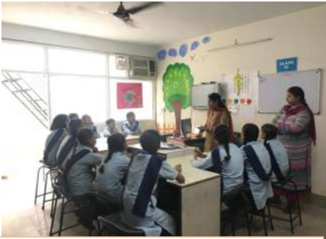
Workshop for student of Noida Deaf Society Primary School on adolescent