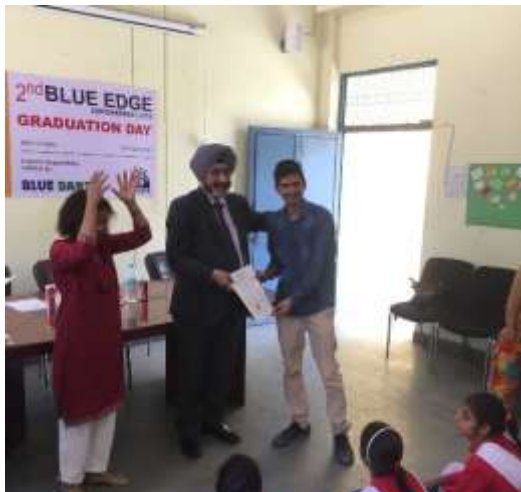
Blue Dart Blue Edge Empowering Lives- Graduation Ceremony